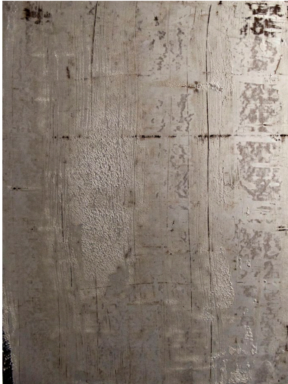
Silver Lake III enamel, bitumen, smoke, graphite on paper laid on canvas 101 X 73 cm 2012