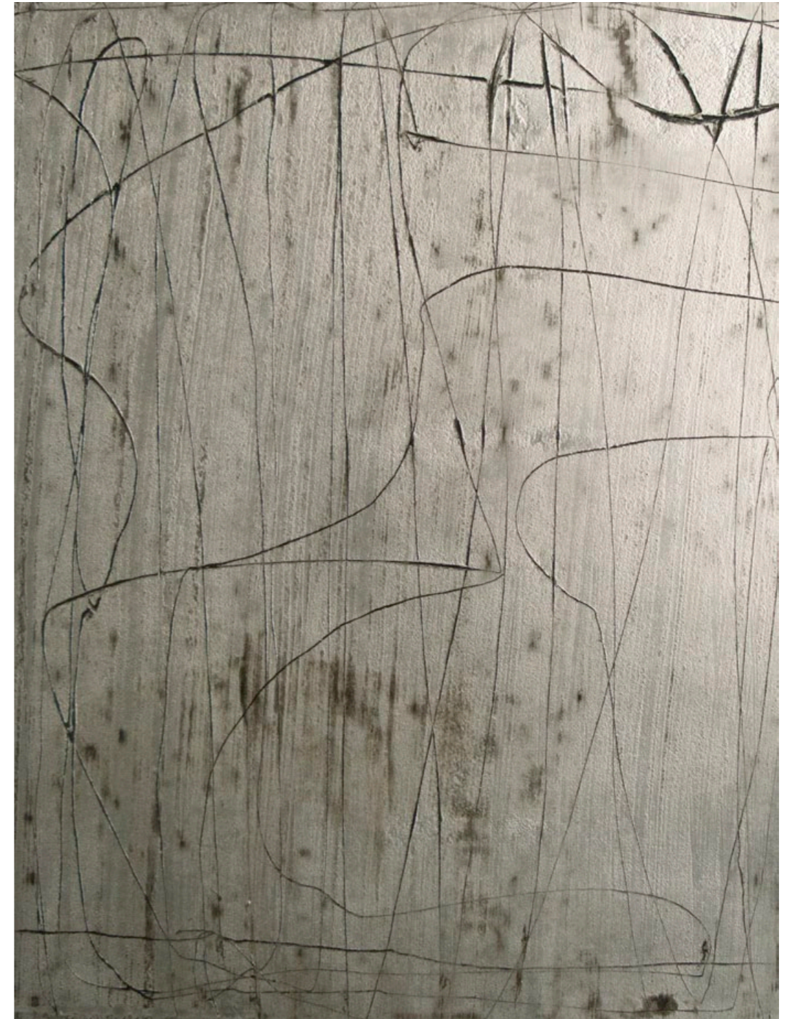
Silver Lake IV enamel, bitumen, smoke, graphite on paper laid on canvas 101 X 73 cm 2012