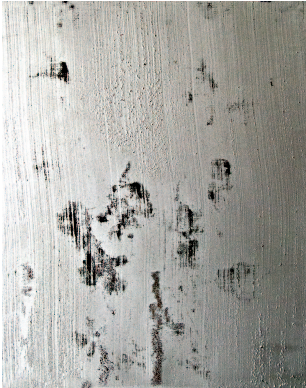
Silver Lake XXV enamel, aluminum powder, bitumen, smoke, graphite on paper 73.5 X 58.5 cm 2012