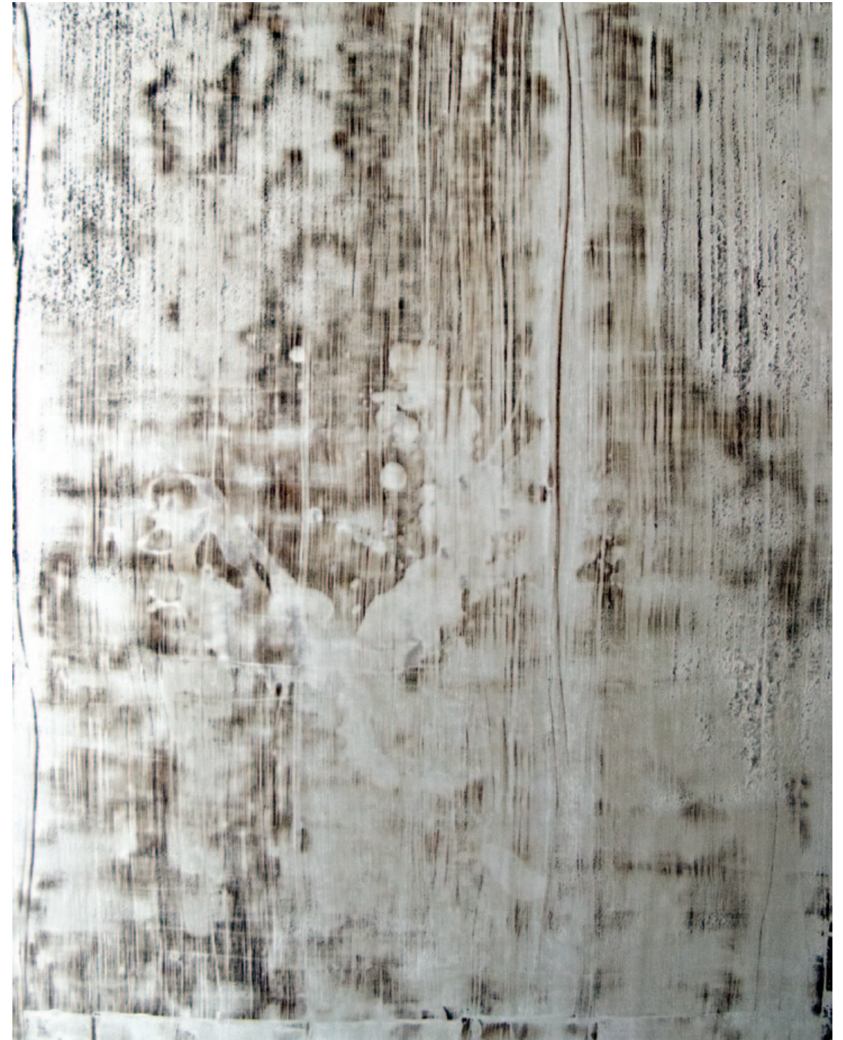
Silver Lake XXIV enamel, aluminum powder, bitumen, smoke, graphite on paper 73.5 X 58.5 cm 2012