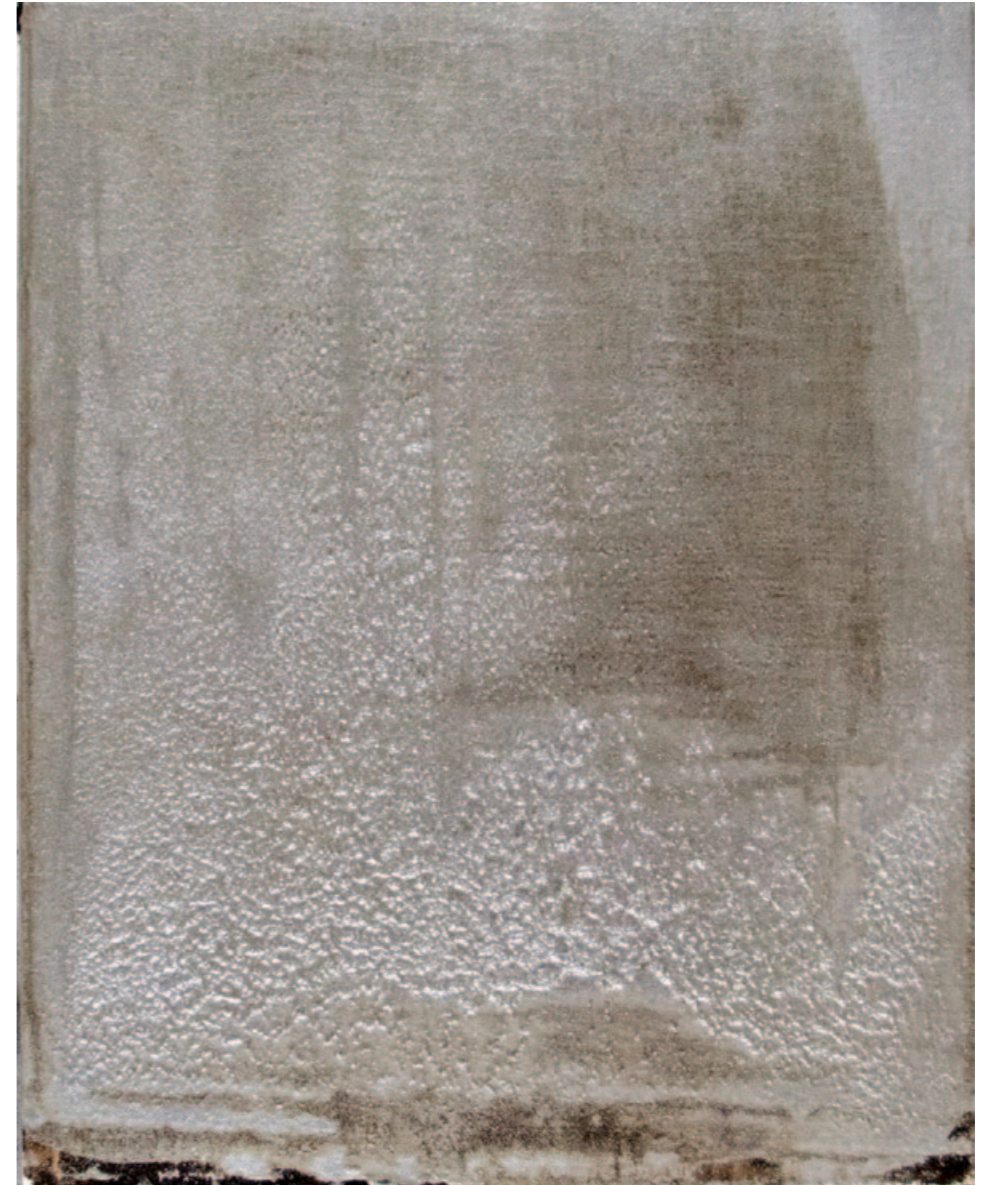
Reflection XIII aluminum paint, asphalt, burlap, graphite powder on canvas 50.5 X 41 cm 2012