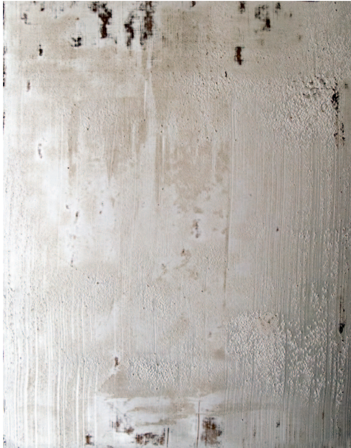
Silver Lake XVI enamel, aluminum powder, bitumen, smoke, graphite on paper 73.5 X 58.5 cm 2012