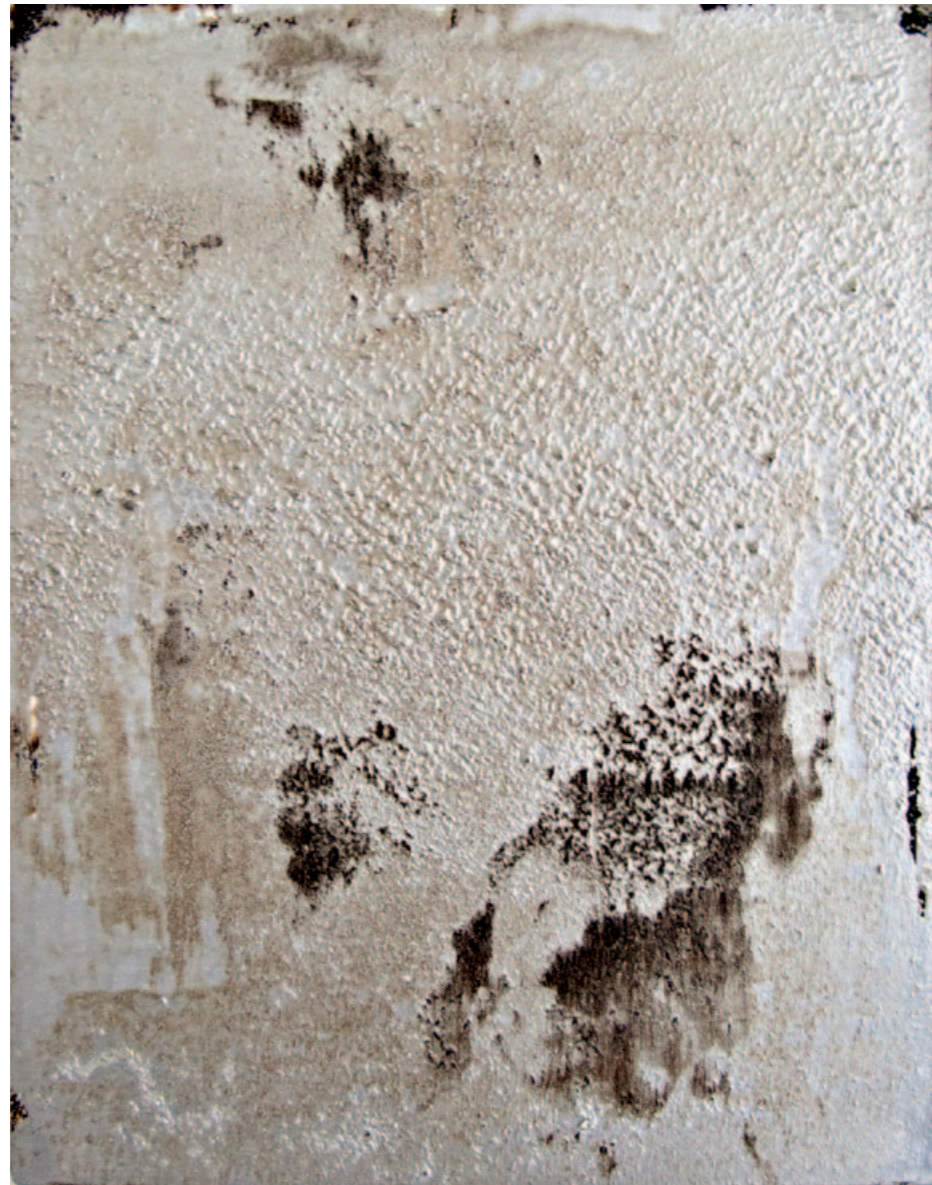
Reflection IV aluminum paint, asphalt, burlap, graphite powder on canvas 50.5 X 41 cm 2012