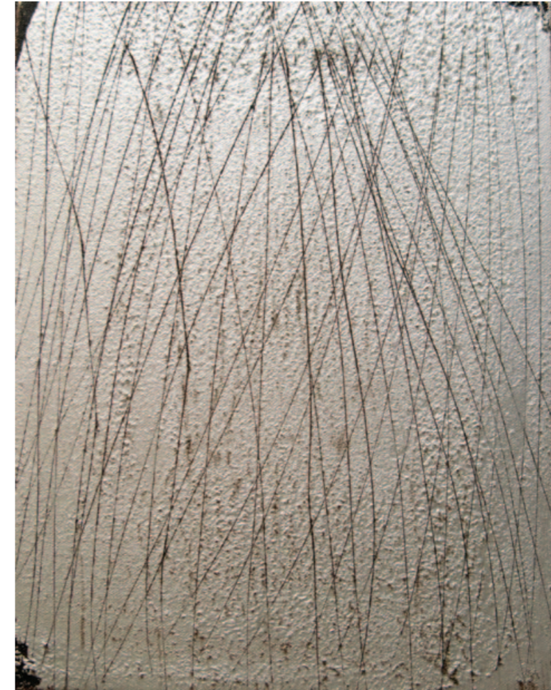
Reflection XXIII aluminum paint, asphalt, burlap, graphite powder on canvas 35.5 X 28 cm 2012