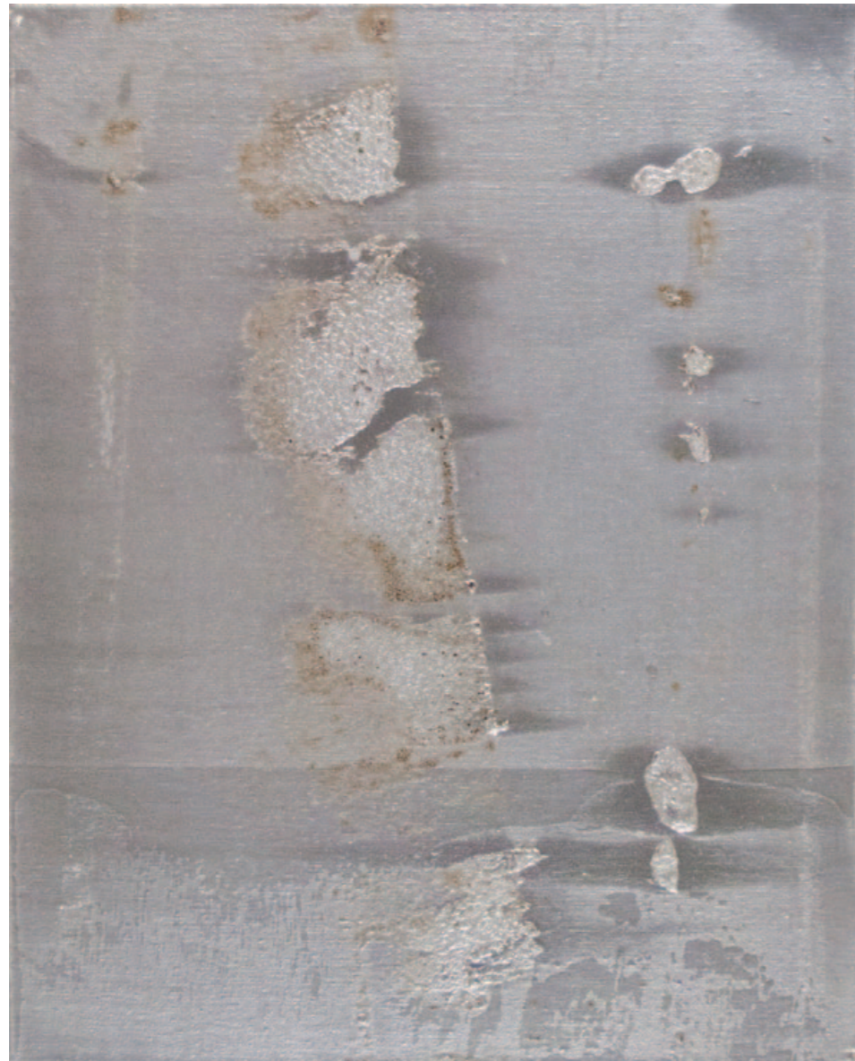
Reflection X Mixed Media on Canvas 50.5 X 41 cm 2012