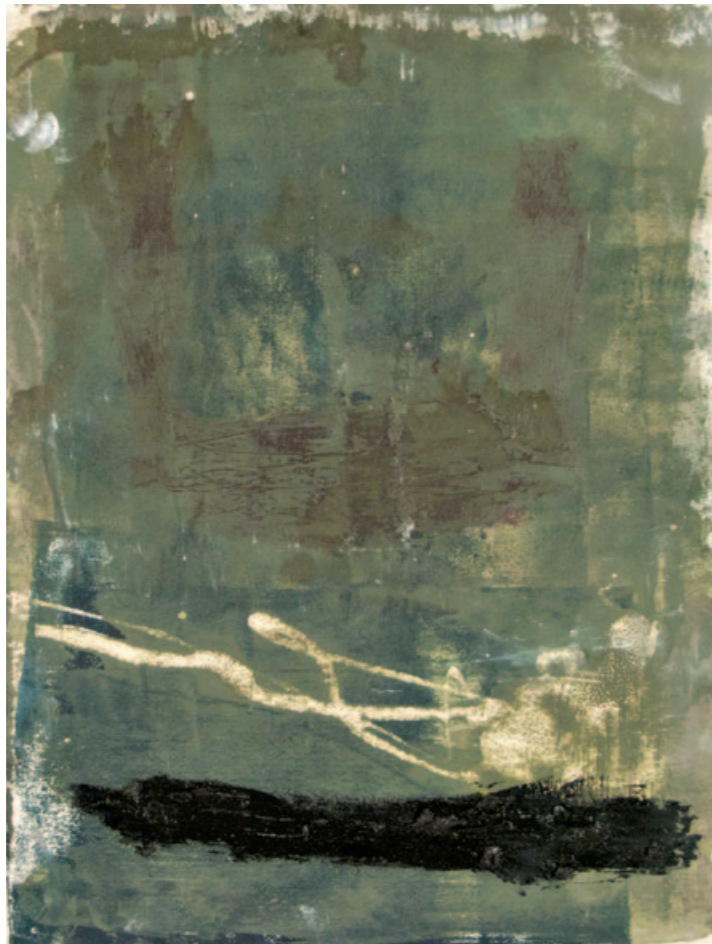
Untitled VI oil, asphaltum, marble dust, powdered pigment, graphite on paper 28 X 23 cm 2012