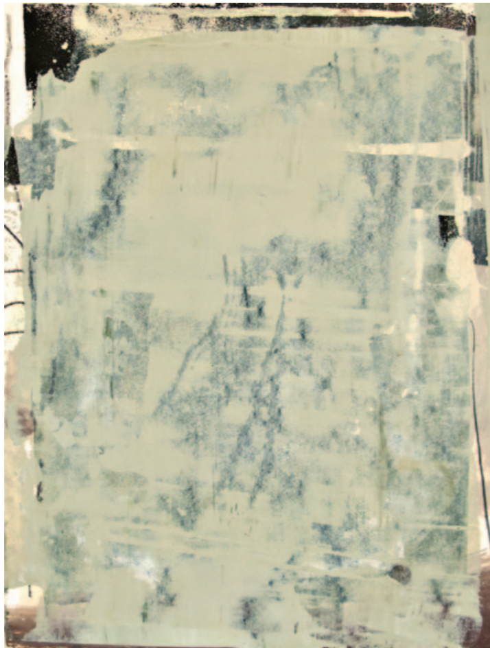
Untitled I oil, asphaltum, marble dust, powdered pigment, graphite on paper 28 X 23 cm 2012