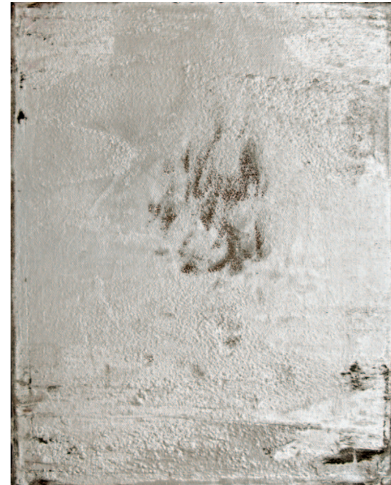
Reflection XXI aluminum paint, asphalt, burlap, graphite powder on canvas 35.5 X 28 cm 2012