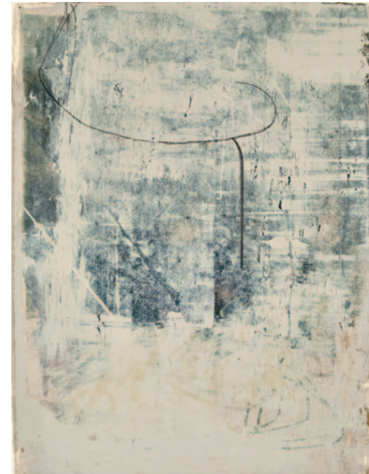
Untitled IV oil, asphaltum, marble dust, powdered pigment, graphite on paper 28 X 23 cm 2012