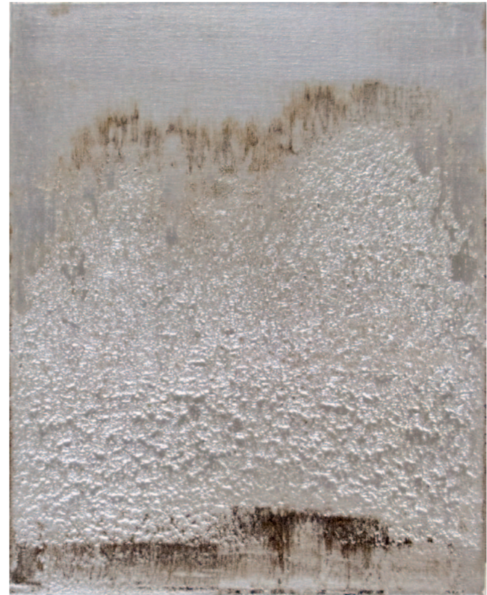
Reflection XI aluminum paint, asphalt, burlap, graphite powder on canvas 50.5 X 41 cm 2012