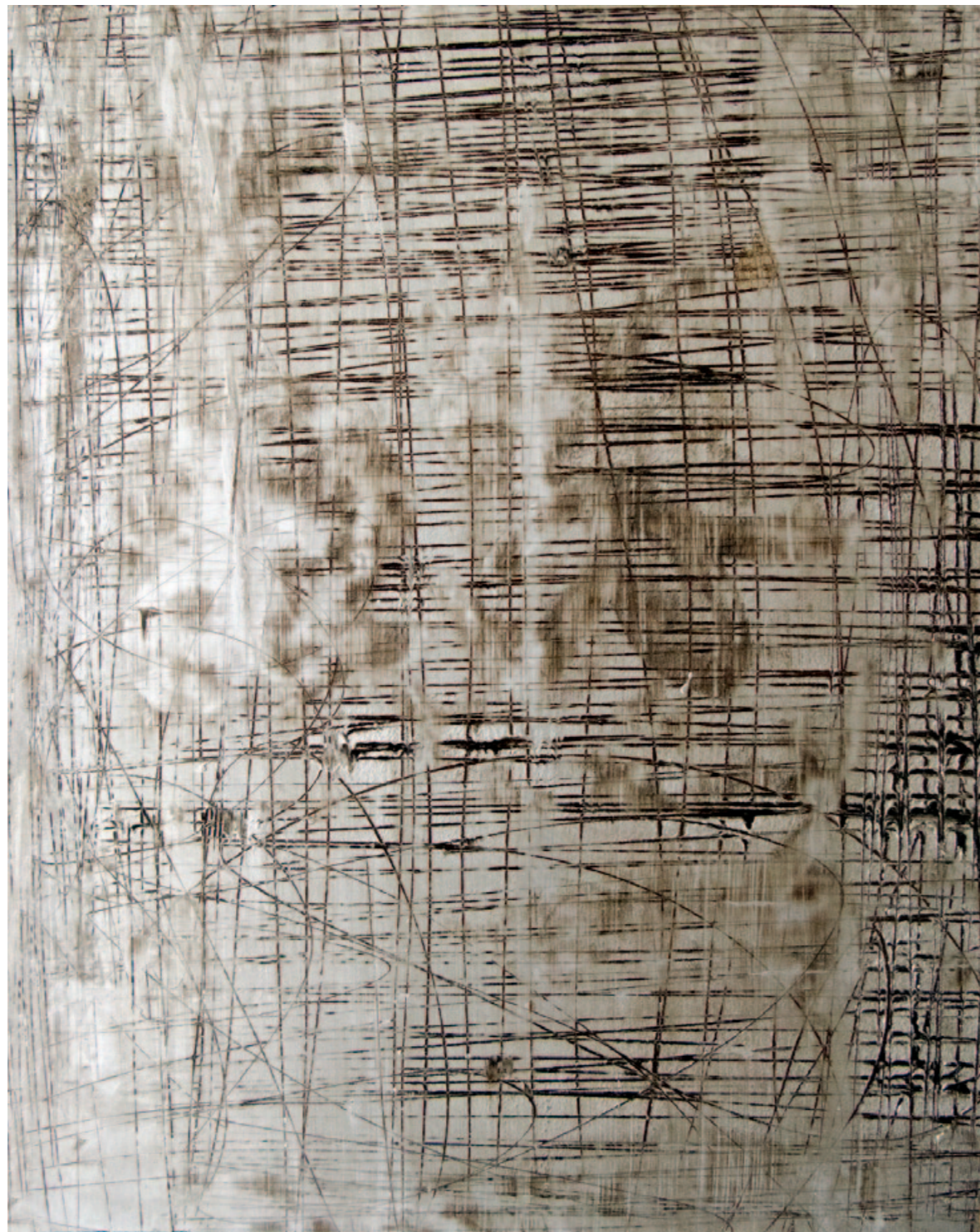
Silver Lake XXIII enamel, aluminum powder, bitumen, smoke, graphite on paper 73.5 X 58.5 cm 2012