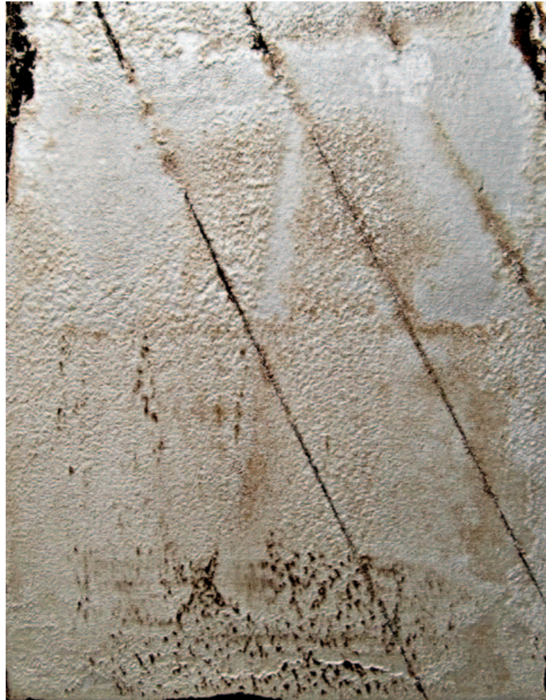
Reflection XXII aluminum paint, asphalt, burlap, graphite powder on canvas 35.5 X 28 cm 2012