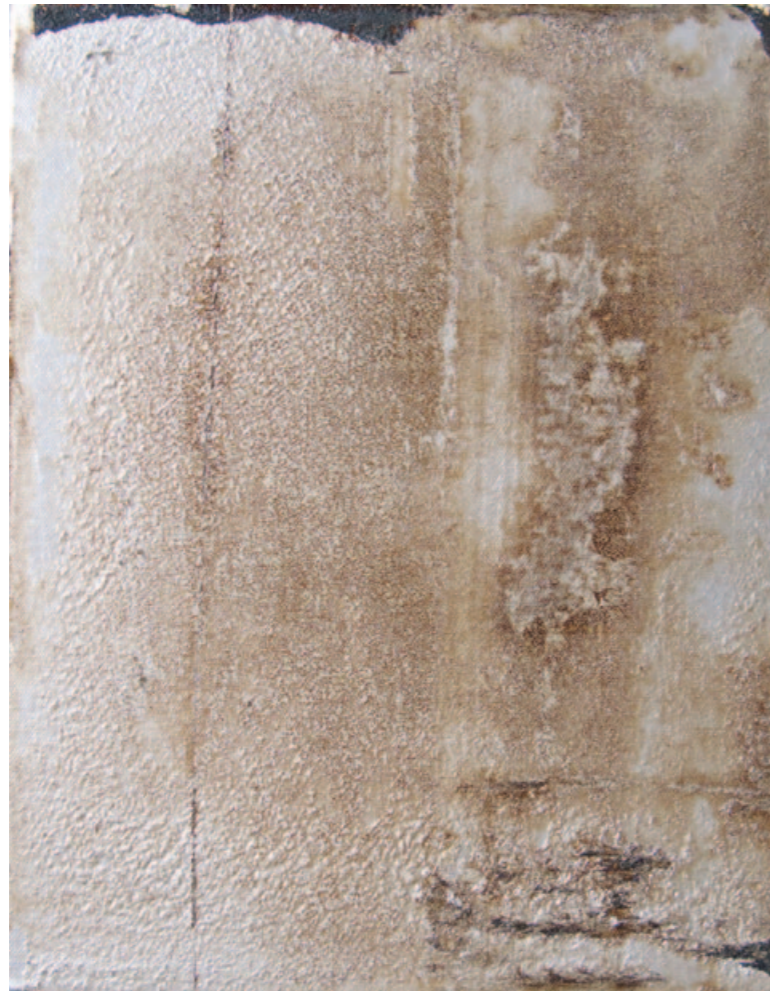
Reflection XX aluminum paint, asphalt, burlap, graphite powder on canvas 35.5 X 28 cm 2012