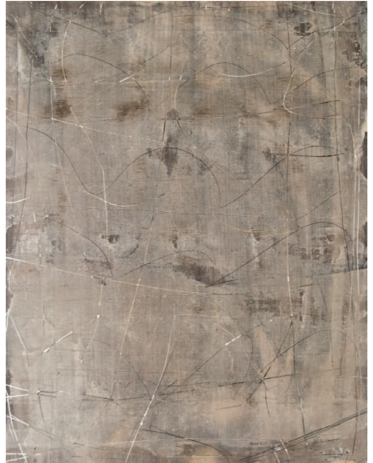
Silver Lake XXVIII oil, smoke, powdered pigment, graphite on paper 61 X 48 cm 2012