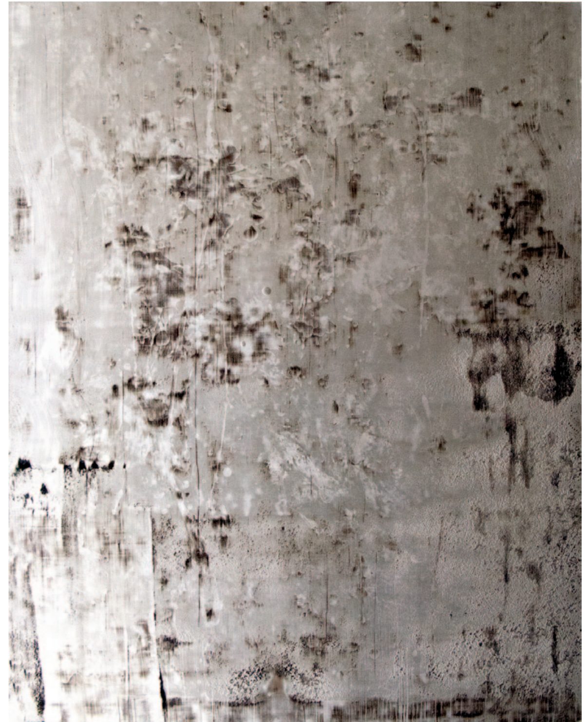
Silver Lake XVII enamel, aluminum powder, bitumen, smoke, graphite on paper 73.5 X 58.5 cm 2012