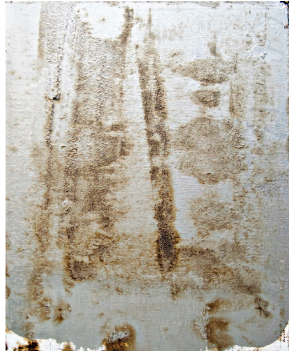
Reflection XV aluminum paint, asphalt, burlap, graphite powder on canvas 50.5 X 41 cm 2012