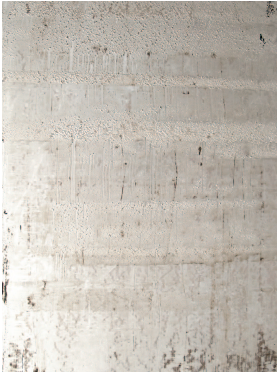
Silver Lake I enamel, bitumen, smoke, graphite on paper laid on canvas 101 X 73 cm 2012