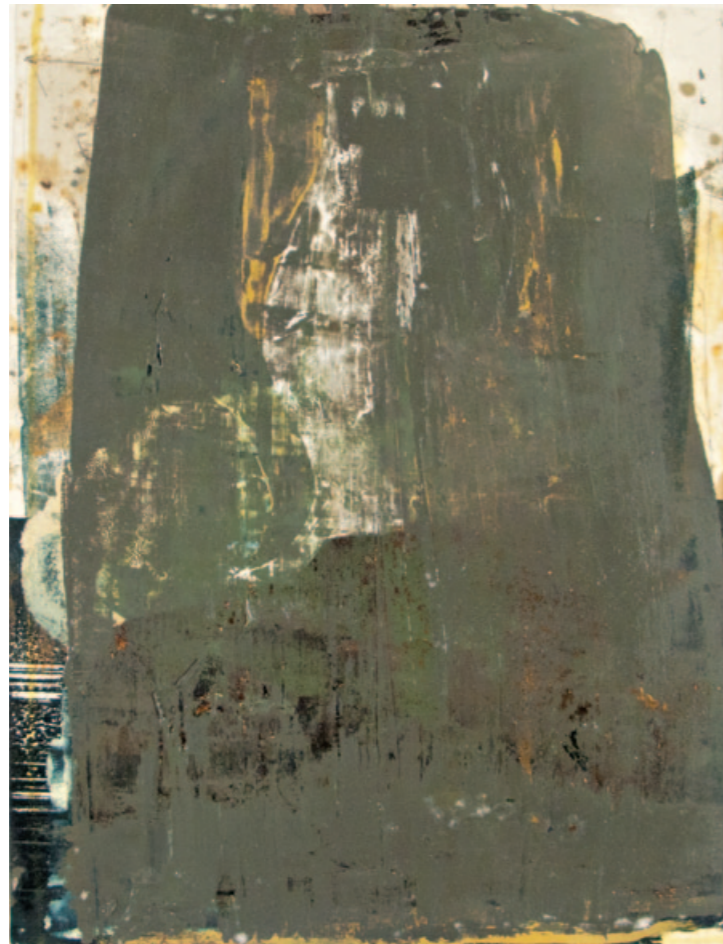
Untitled III oil, asphaltum, marble dust, powdered pigment, graphite on paper 28 X 23 cm 2012