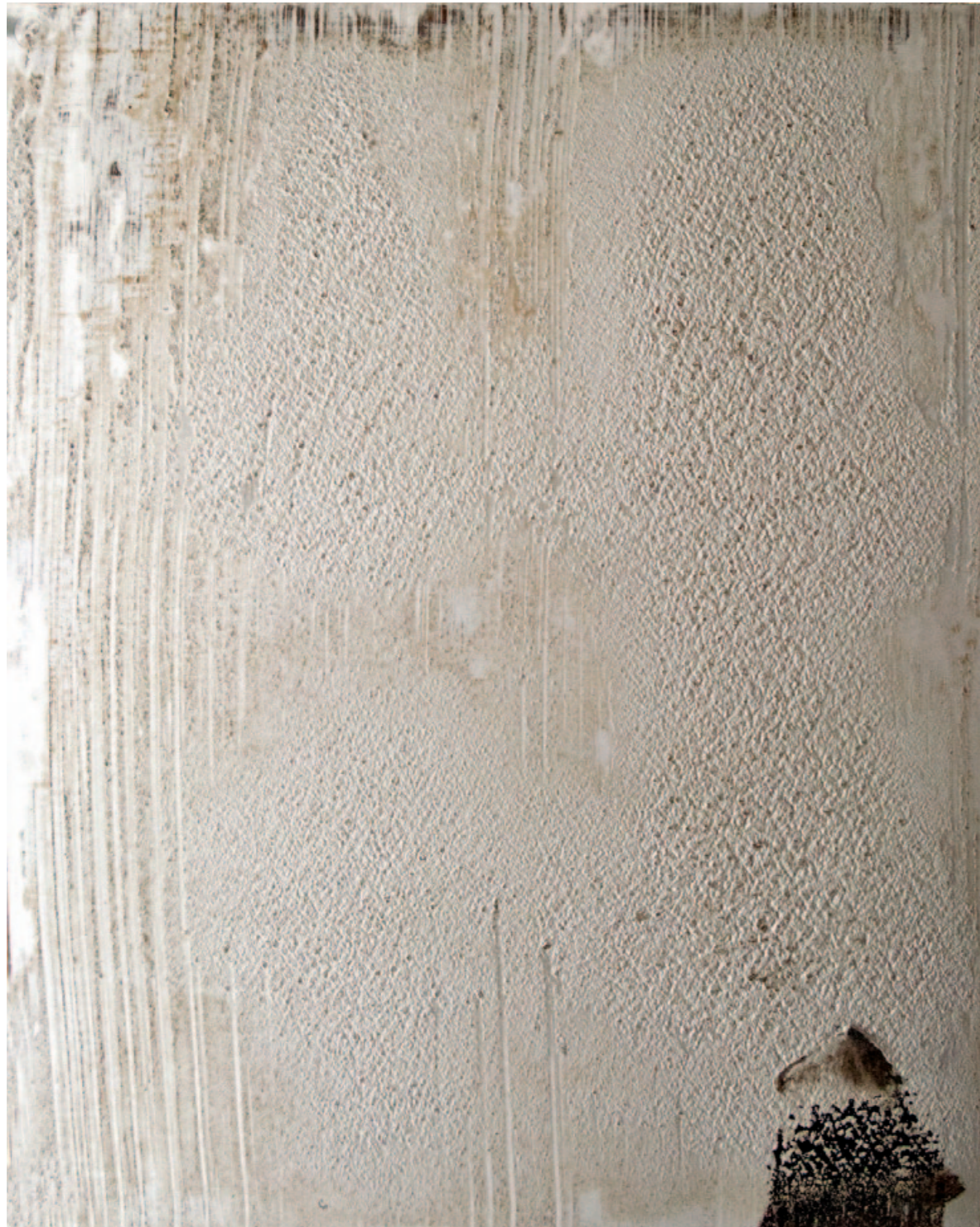
Silver Lake XXI enamel, aluminum powder, bitumen, smoke, graphite on paper 73.5 X 58.5 cm 2012