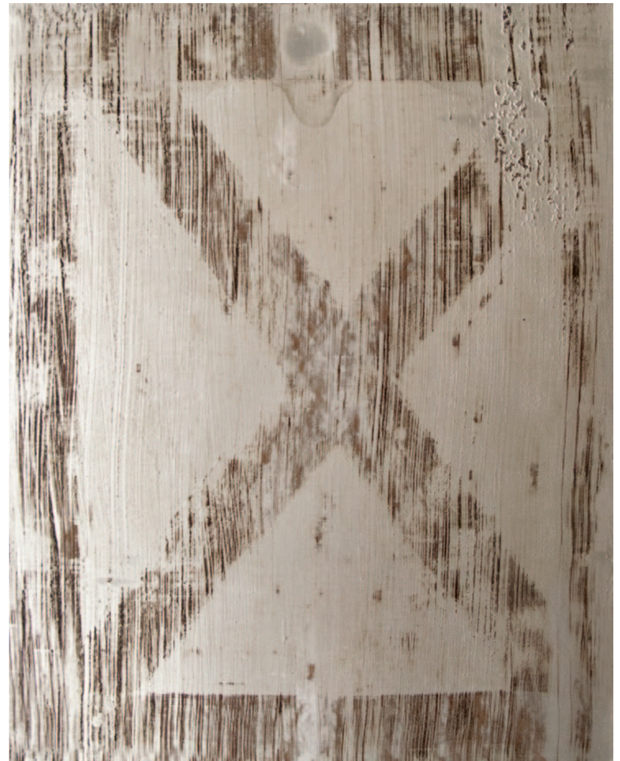
Silver Lake XI enamel, aluminum powder, bitumen, smoke, graphite on paper 73.5 X 58.5 cm 2012