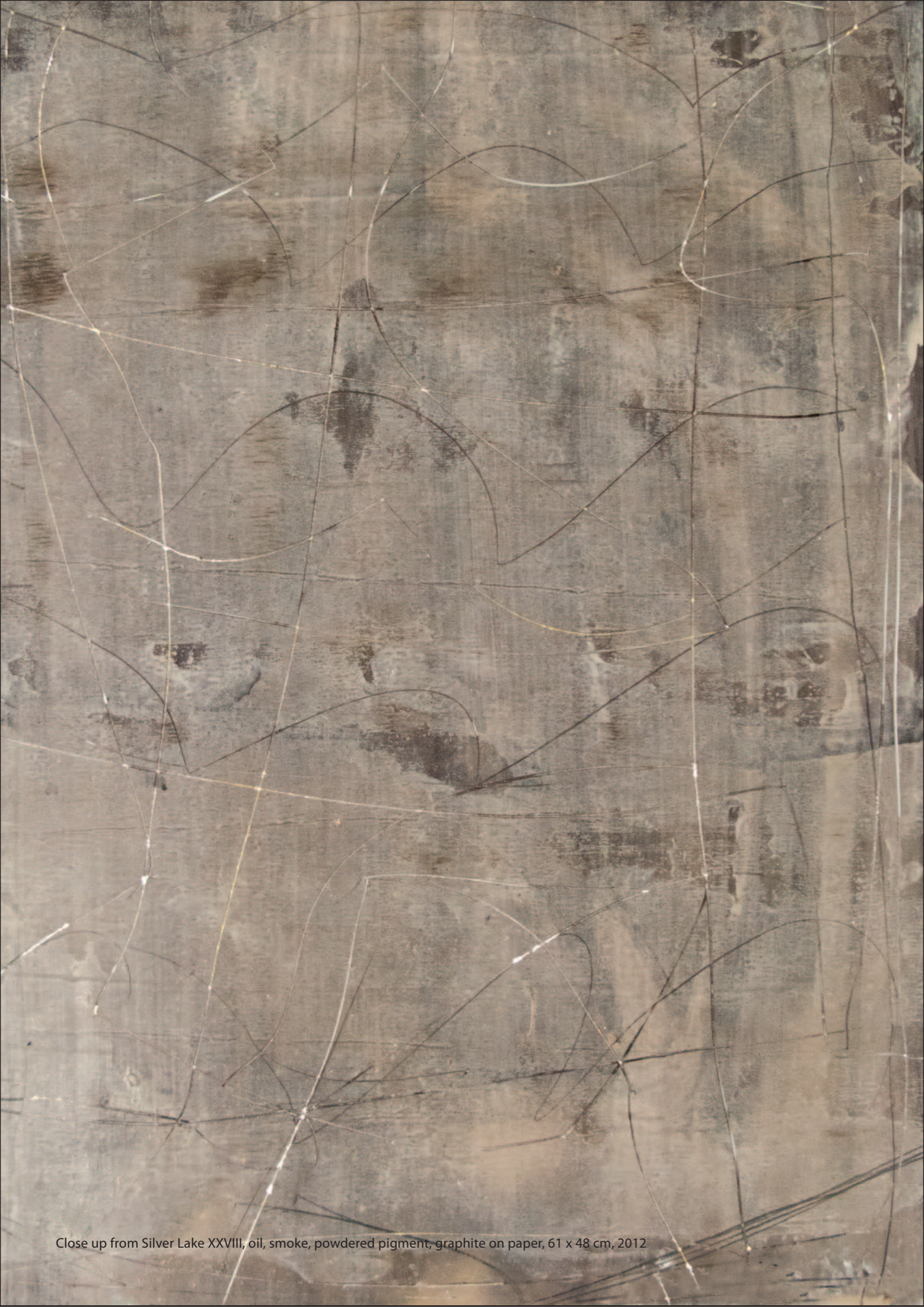
Close up from Silver Lake XXVIII, oil, smoke, powdered pigment, graphite on paper, 61 x 48 cm, 2012