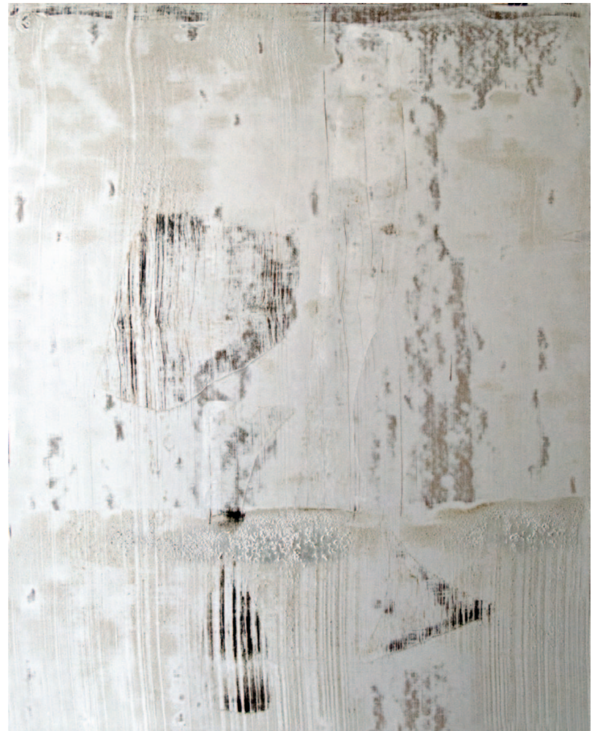
Silver Lake XX enamel, aluminum powder, bitumen, smoke, graphite on paper 73.5 X 58.5 cm 2012