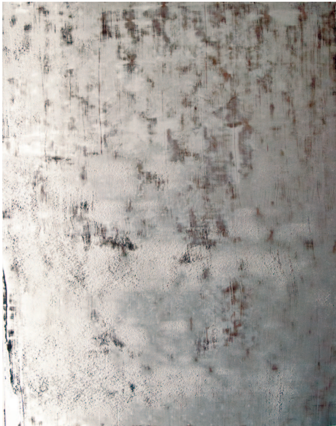
Silver Lake X enamel, aluminum powder, bitumen, smoke, graphite on paper 73.5 X 58.5 cm 2012