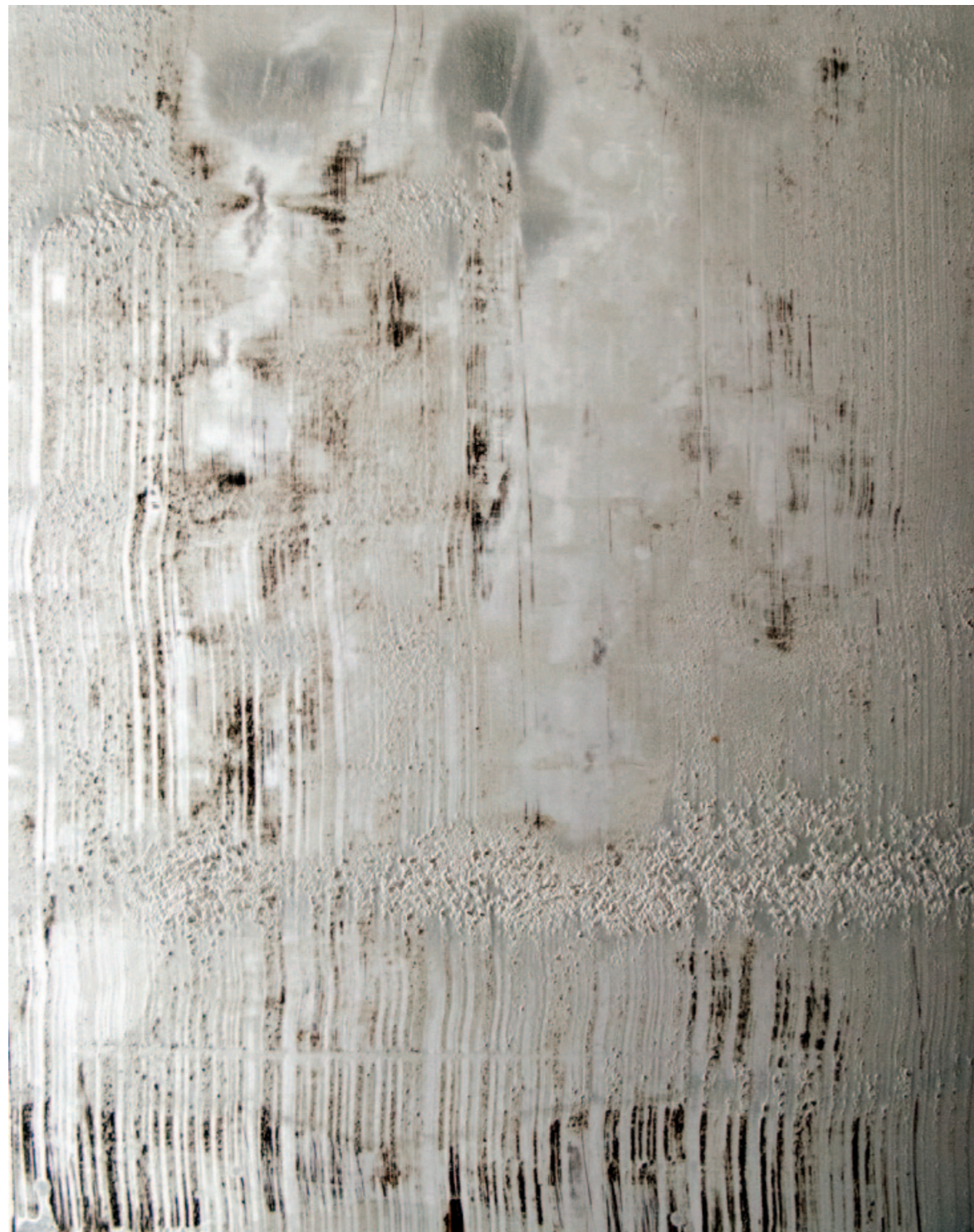
Silver Lake XII enamel, aluminum powder, bitumen, smoke, graphite on paper 73.5 X 58.5 cm 2012