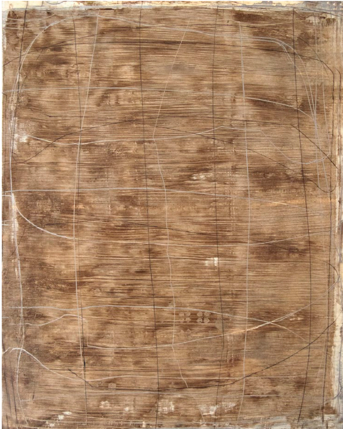
Silver Lake XXVII oil, smoke, powdered pigment, graphite on paper 61 X 48 cm 2012