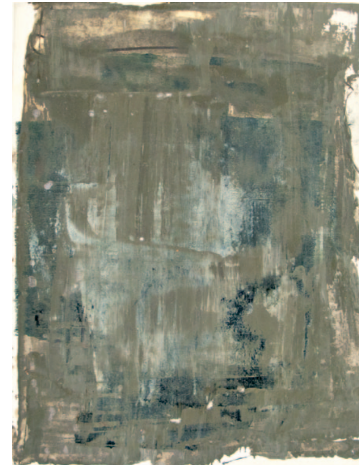
Untitled II oil, asphaltum, marble dust, powdered pigment, graphite on paper 28 X 23 cm 2012