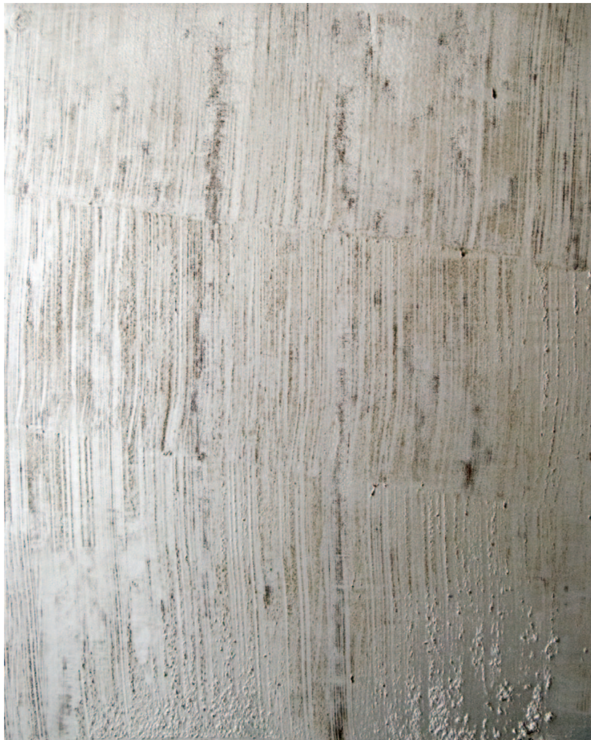
Silver Lake XIX enamel, aluminum powder, bitumen, smoke, graphite on paper 73.5 X 58.5 cm 2012