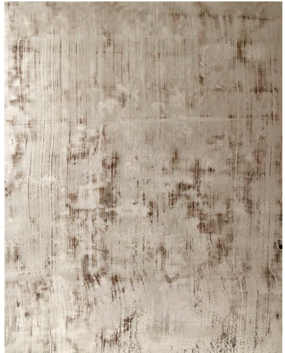
Silver Lake XXVI enamel, aluminum powder, bitumen, smoke, graphite on paper 73.5 X 58.5 cm 2012