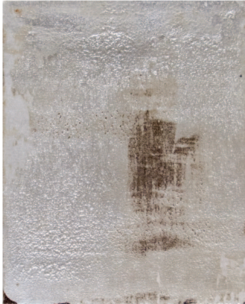
Reflection XII aluminum paint, asphalt, burlap, graphite powder on canvas 50.5 X 41 cm 2012