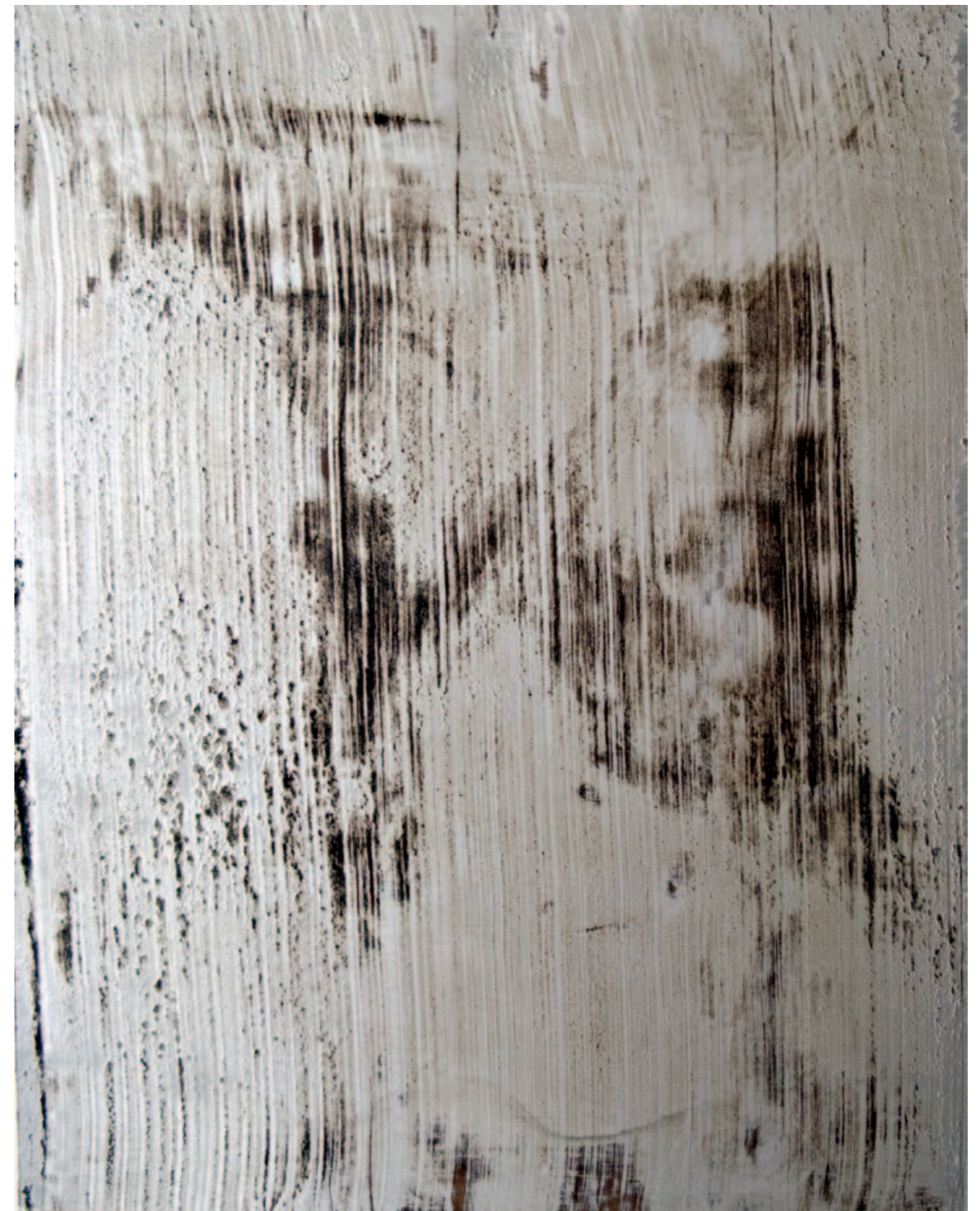
Silver Lake XIII enamel, aluminum powder, bitumen, smoke, graphite on paper 73.5 X 58.5 cm 2012