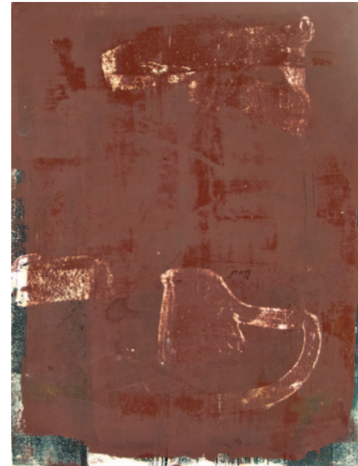
Untitled VII oil, asphaltum, marble dust, powdered pigment, graphite on paper 28 X 23 cm 2012