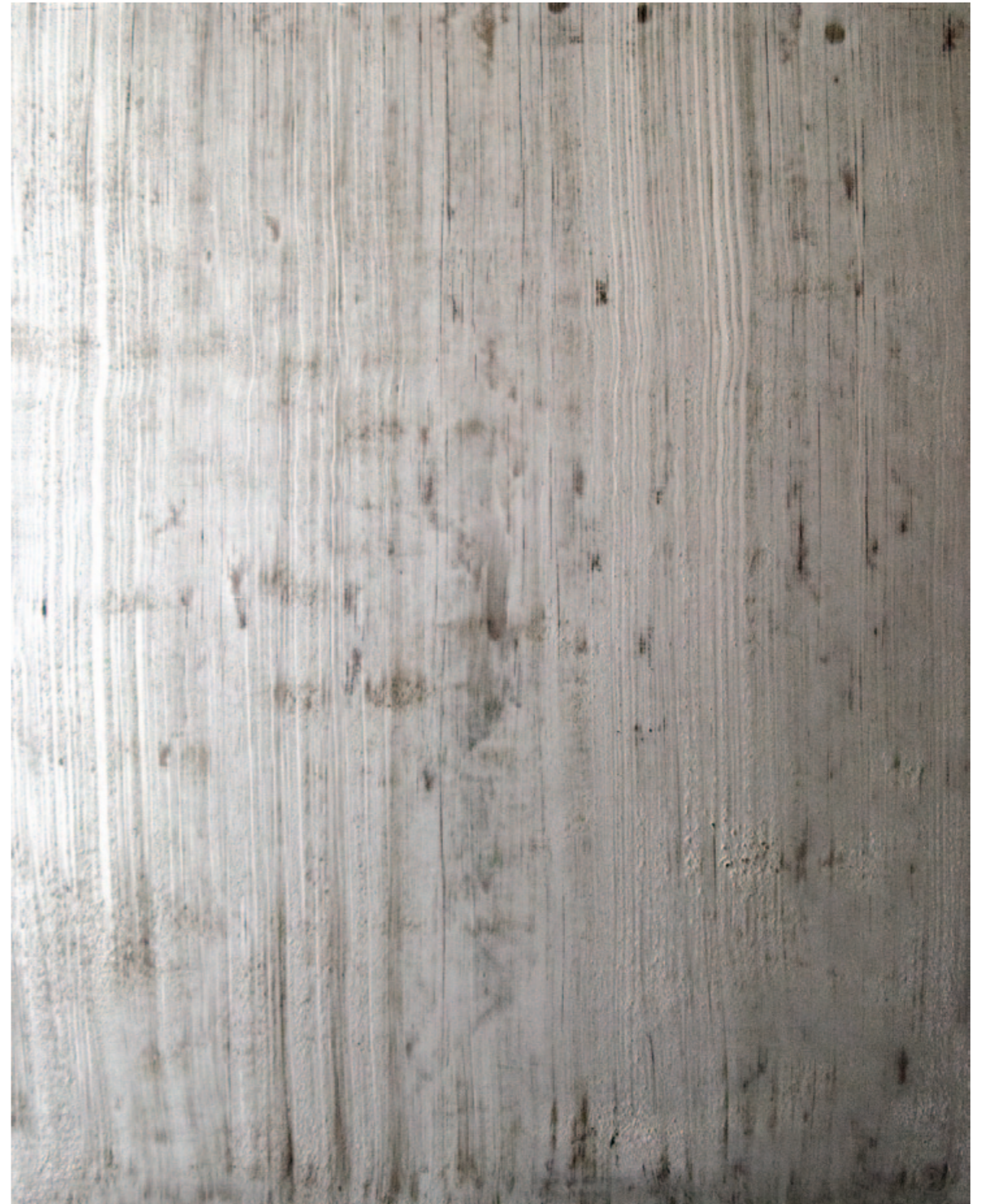
Silver Lake XXII enamel, aluminum powder, bitumen, smoke, graphite on paper 73.5 X 58.5 cm 2012