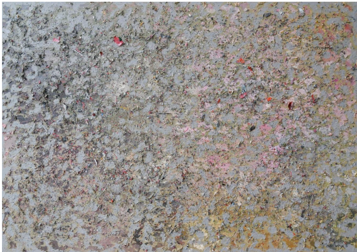
Mat Y.V. Acrylic on Canvas, 162 x 114 cm, 2011

combination of feminine curves and asymmetric libraries suggesting old sailboat parts. A veritable sail dance! This is how he expresses his desire for freedom.