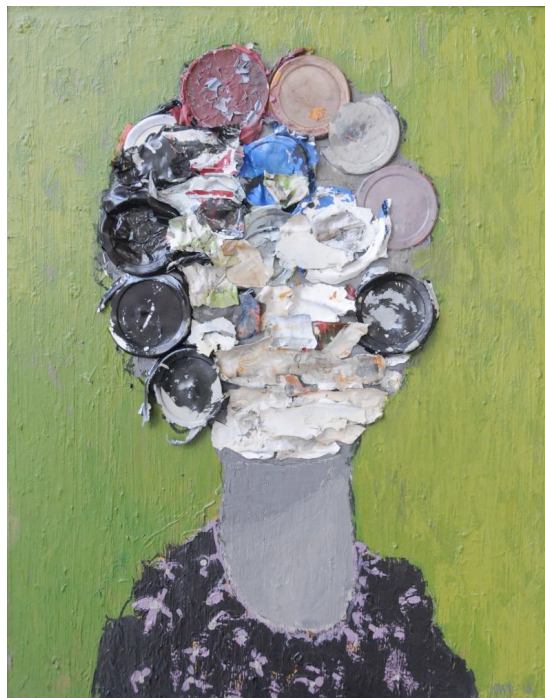
BM – Miss Be Good Y Acrylic on Canvas, 65 x 81cm, 2010

For high resolution images and further information please contact: