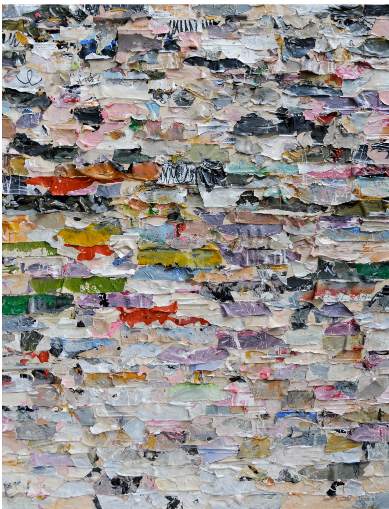
Big Mat Y Acrylic on Canvas Collage, 146 x 114 cm, 2012

Sin Sin Fine Art proudly presents a solo exhibition of the French artist Youri Leroux .