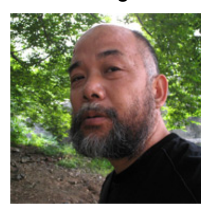
(b. 1957 in Beijing, China)

Bai Xincheng trained initially in calligraphy before developing his unique line figures. For him, line is a highly individualistic language that serves as a point for wandering through the abstracts of psychology. In a rested state or a confused one, the most irreducibly basic elements