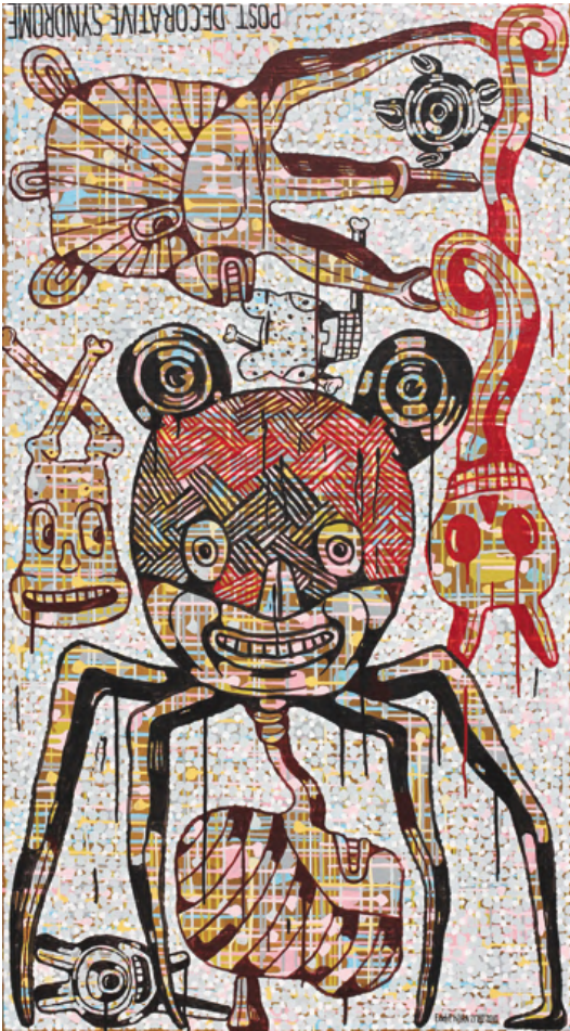
EddiE haRA Post Decorative Syndrome Acrylic on canvas 180 x 100 cm, 2010