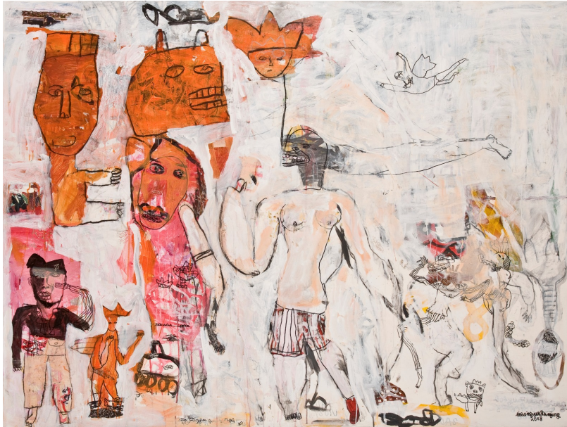
Bob Sick Yudhita Journey of Mr. General in White, Acrylic & Collage on Canvas 150mm x 200mm, 2008