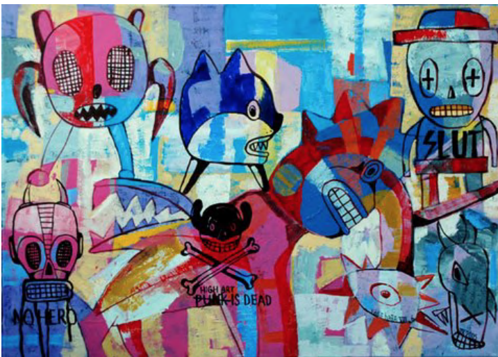
EddiE haRA No Hero Acrylic on canvas 50 x 70cm, 2005