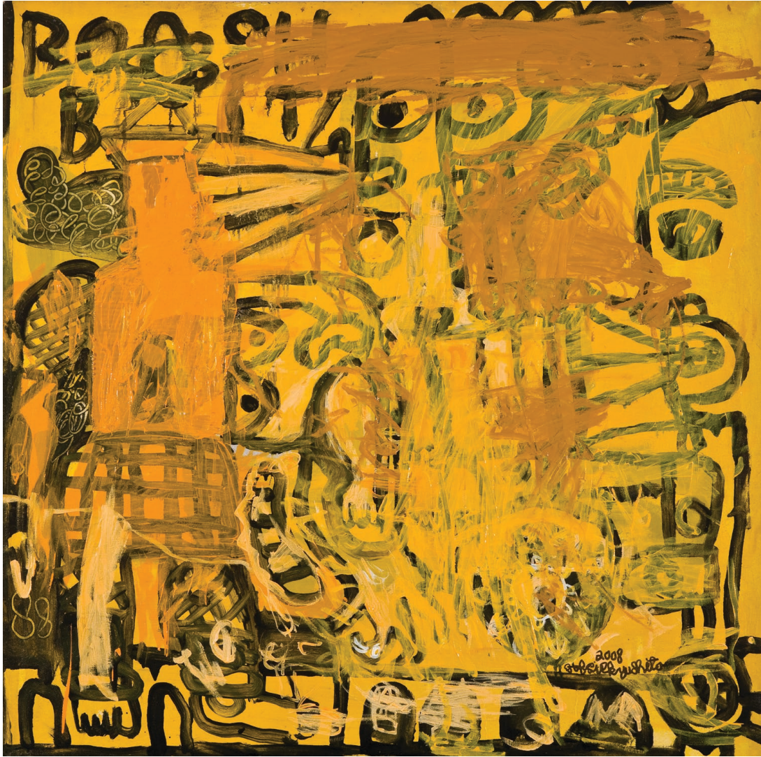
Bob Yudhita Agung YELLOW BRUTALITY acrylic on canvas, 100 x 100 cm, 2008