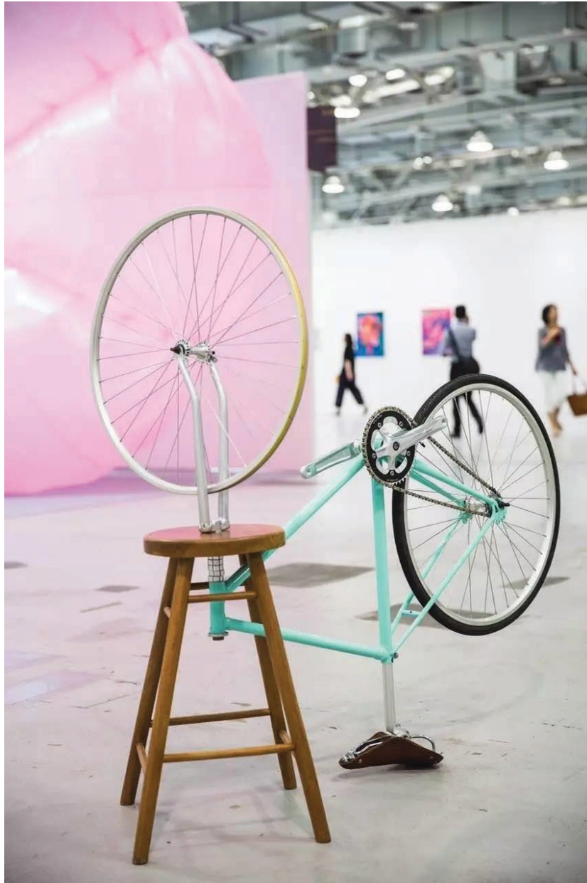
Eddi Prabandono AFTER DUCHAMP bicycle and stool, life size, 2015